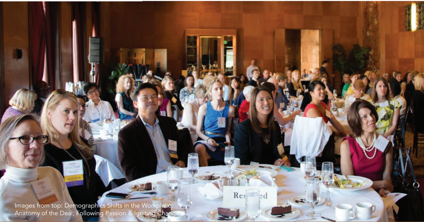
Images from top: Demographics Shifts in the Workplace; Anatomy of the Deal; Following Passion & Igniting Change

SPONSORSHIP OPPORTUNITIES 2017 MAKE A DIFFERENCE